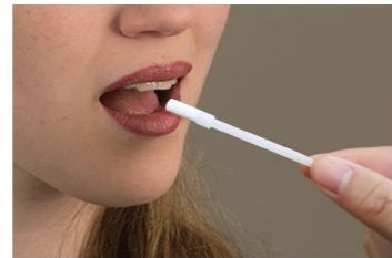
By Saliva collector