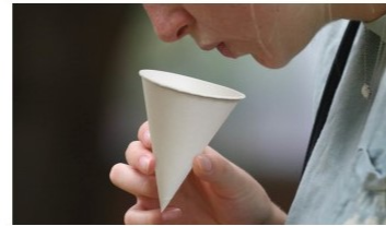
By Saliva collect cup or